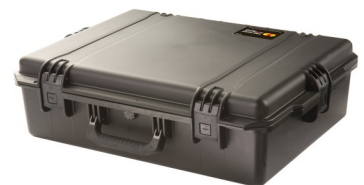
Storage / Carrying Case