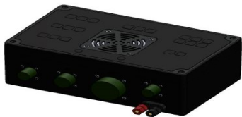
MILES Combat Vehicle Fire Control Emulator (MCVFCE) Assembly